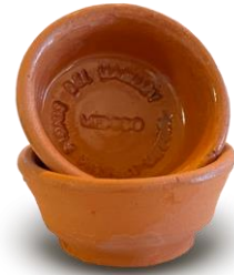
Copitas are 1 oz. filled to the top